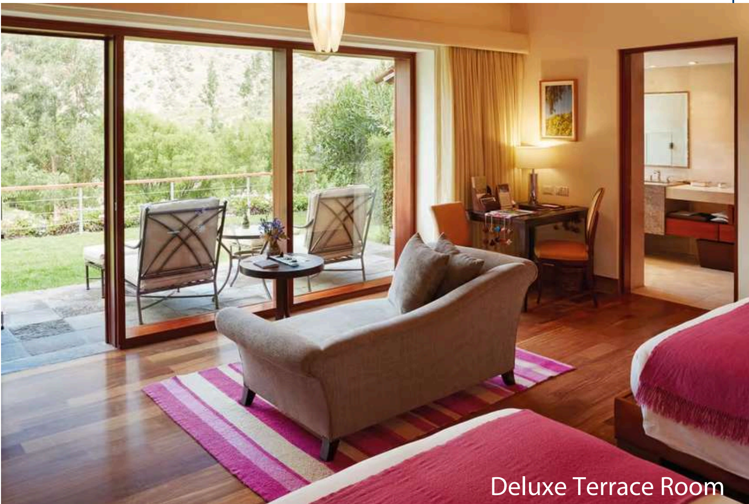
Deluxe Terrace Room