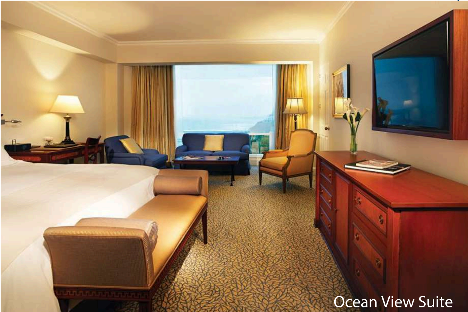
Ocean View Suite