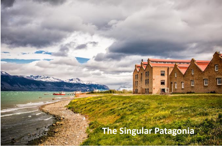
The Singular Patagonia